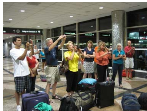
Nervous parents, seeing their kids off