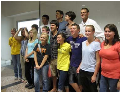
Costa Rica Mission-Bound